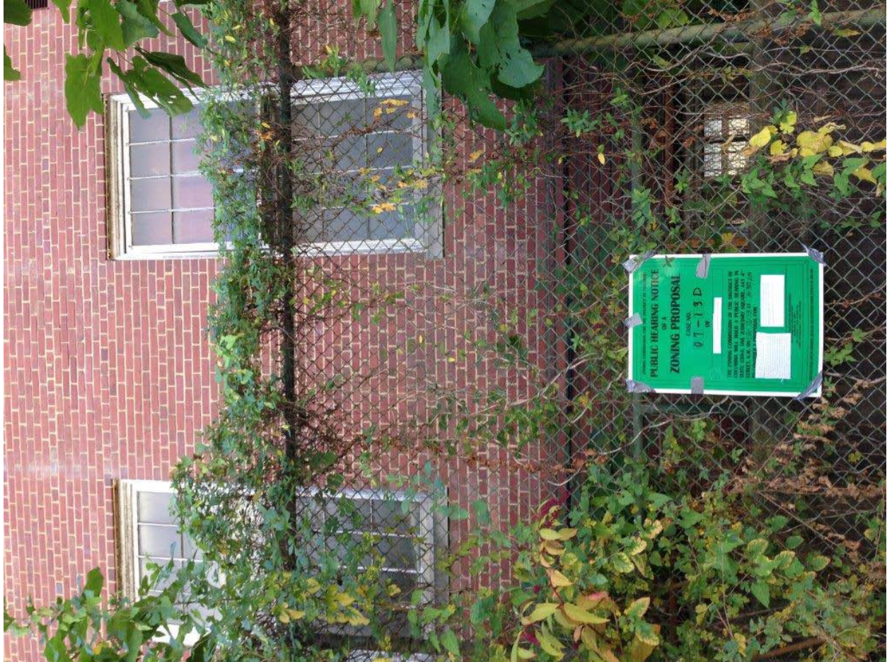
ZC 07-13D - H Street, SW (Back of School) - 9/30/13