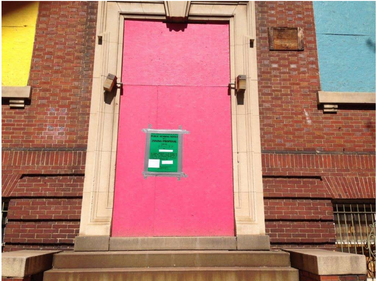
ZC 07-13D - I Street, SW (Front) - 9/30/13