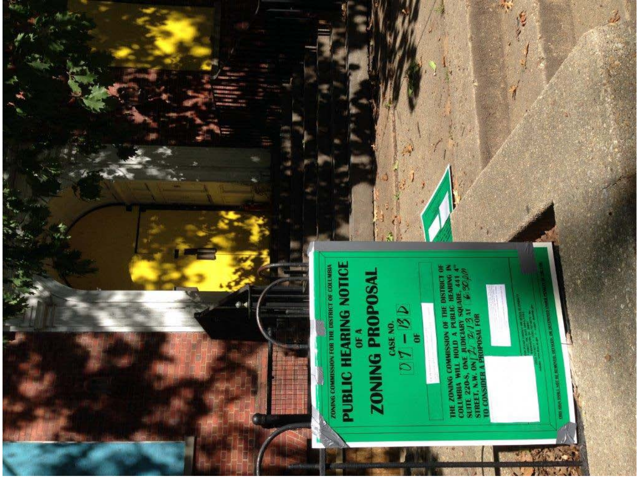
ZC 07-13D, I Street, SW (Front) - 9/30/13